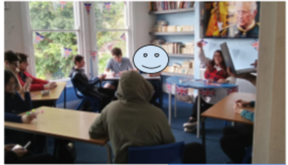
Playing Royal Bingo