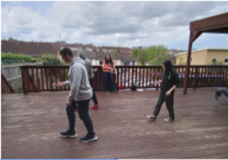
Egg & Spoon Race